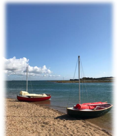
Ad hoc potter Newtown 2019