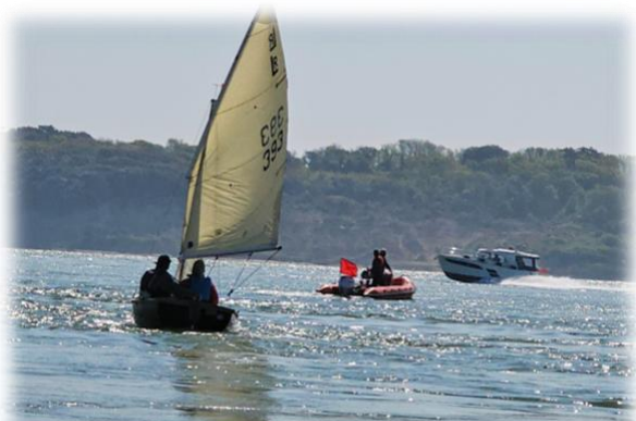
En route to Yarmouth KYC/HCSC joint potter 2025